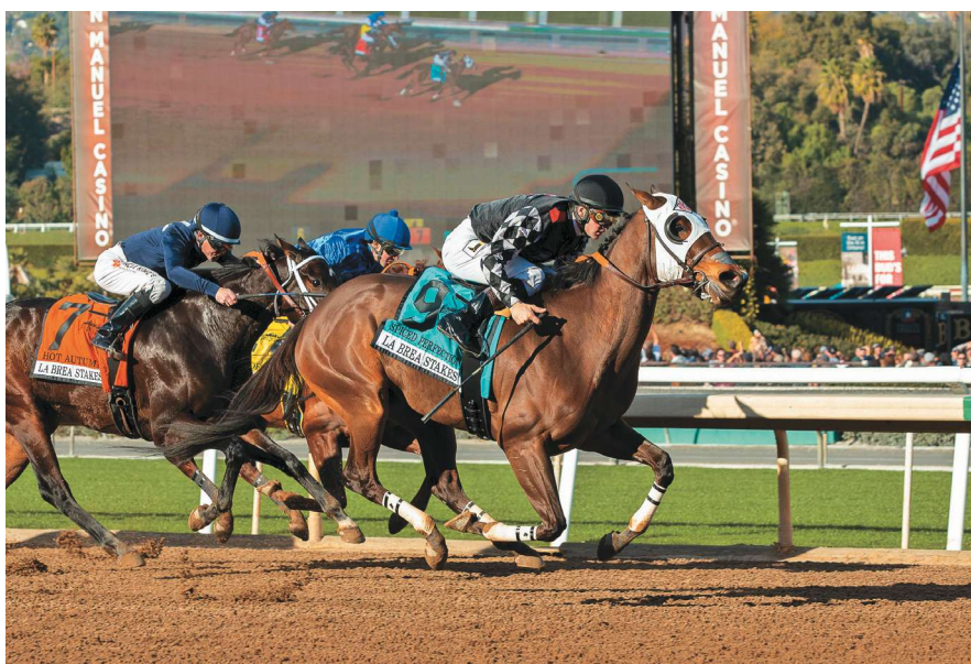
Spiced Perfection ended her 2018 campaign with a win in the grade 1 La Brea Stakes

In her first 2019 start and first for the new ownership, Spiced Perfection traveled to Laurel Park for the Barbara Fritchie Stakes (G3). She faced a powerhouse local runner, Late Night Pow Wow, who was riding an eight-race winning streak. Spiced Perfection almost upset Late Night Pow Wow, running second by just a head.